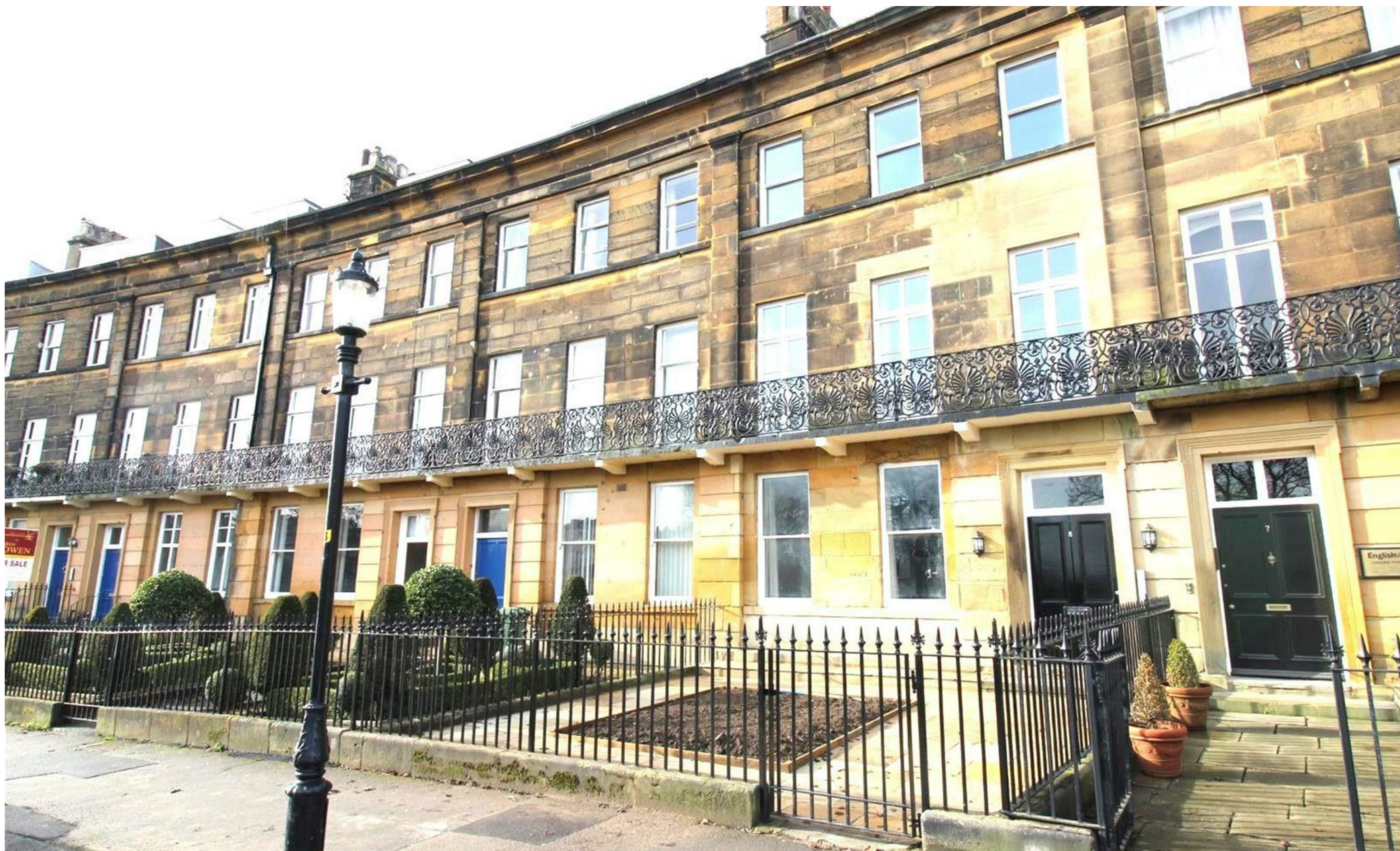
Flat 7, 8 The Crescent, Scarborough YO11 2PW £650 PCM